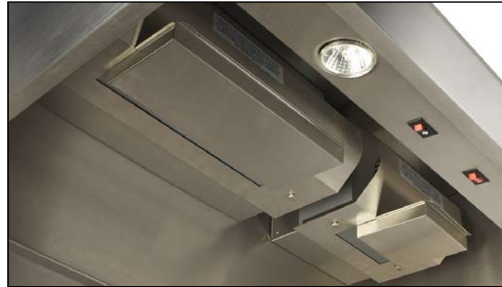
Optional pullout E-Z clean grease trays