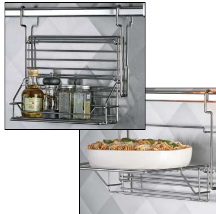
All-In-One Warming Shelf & Spice Rack